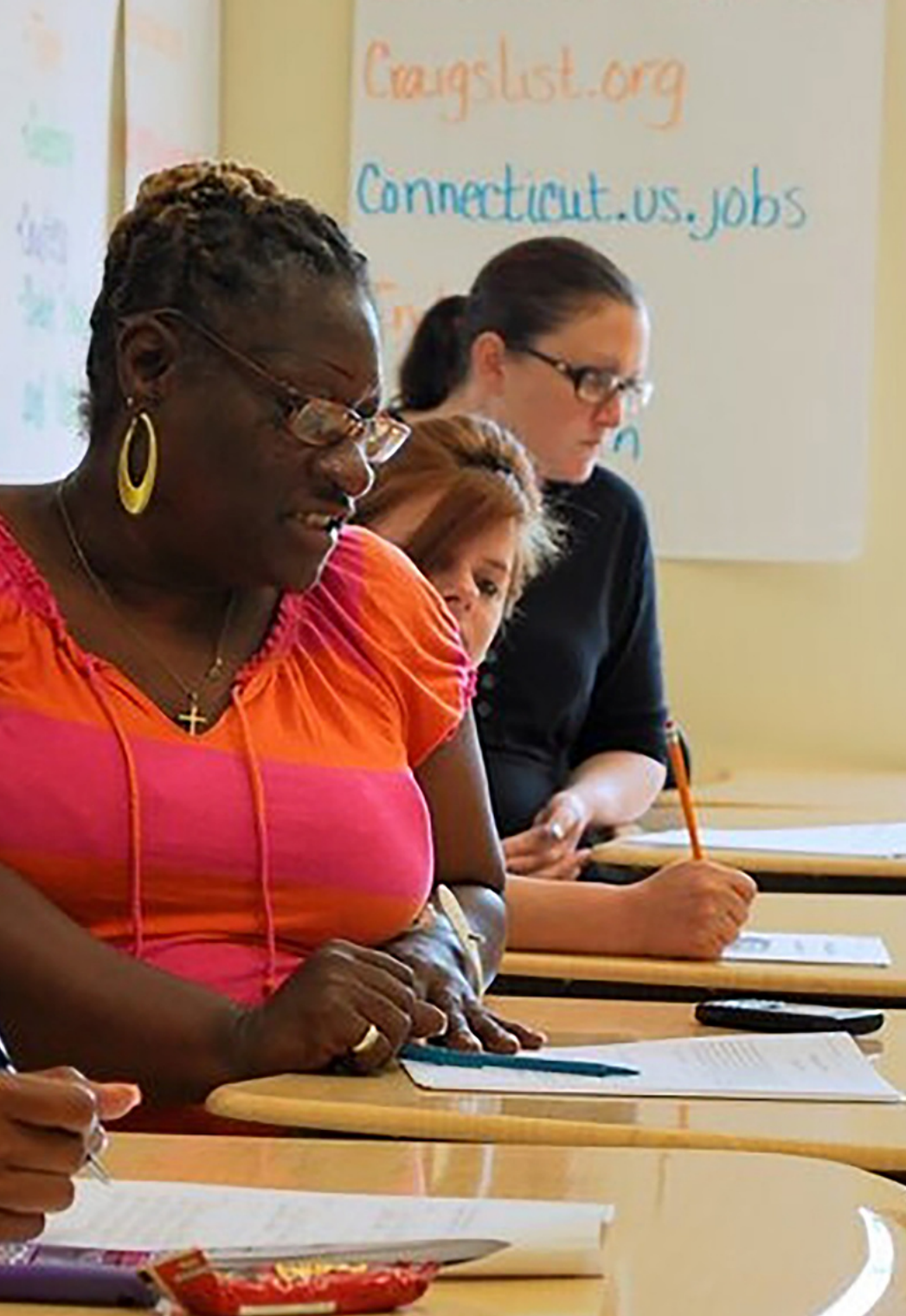
Inspirica's Support Services offer employment and vocational training, financial management classes, parenting classes, and children's programs, as well as housing and job placement and retention.