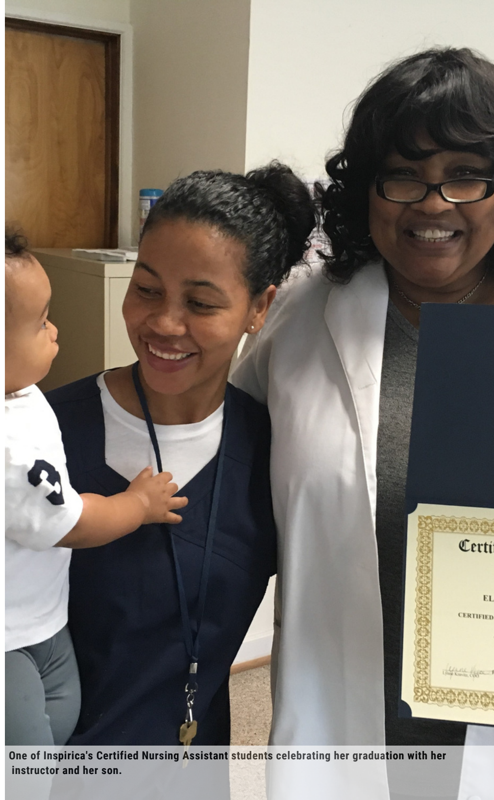
One of Inspirica's Certified Nursing Assistant students celebrating her graduation with her instructor and her son.