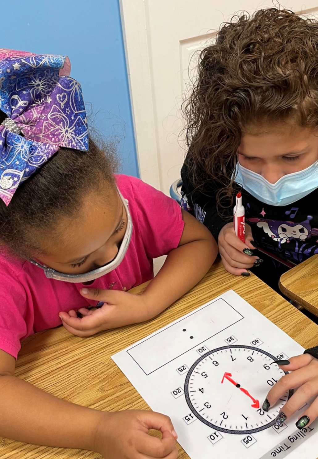
Two children practice telling time during Inspirica's after-school Youth Center Program, offered on weekday afternoons for all the school-aged children living in our Family Shelter, where they are provided homework assistance, playtime, enrichment activities, art therapy, and more.