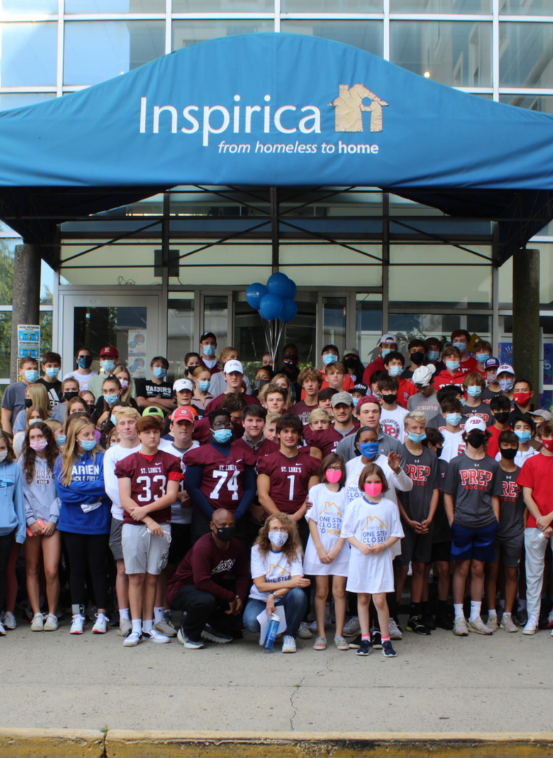
Inspirica's "One Step Closer to Home" Walk-A-Thon takes place every Fall and is one of our major fundraisers as well as a community awareness event. Participants, including our partners from St. Luke's school in New Canaan, walk along the route throughout downtown Stamford.