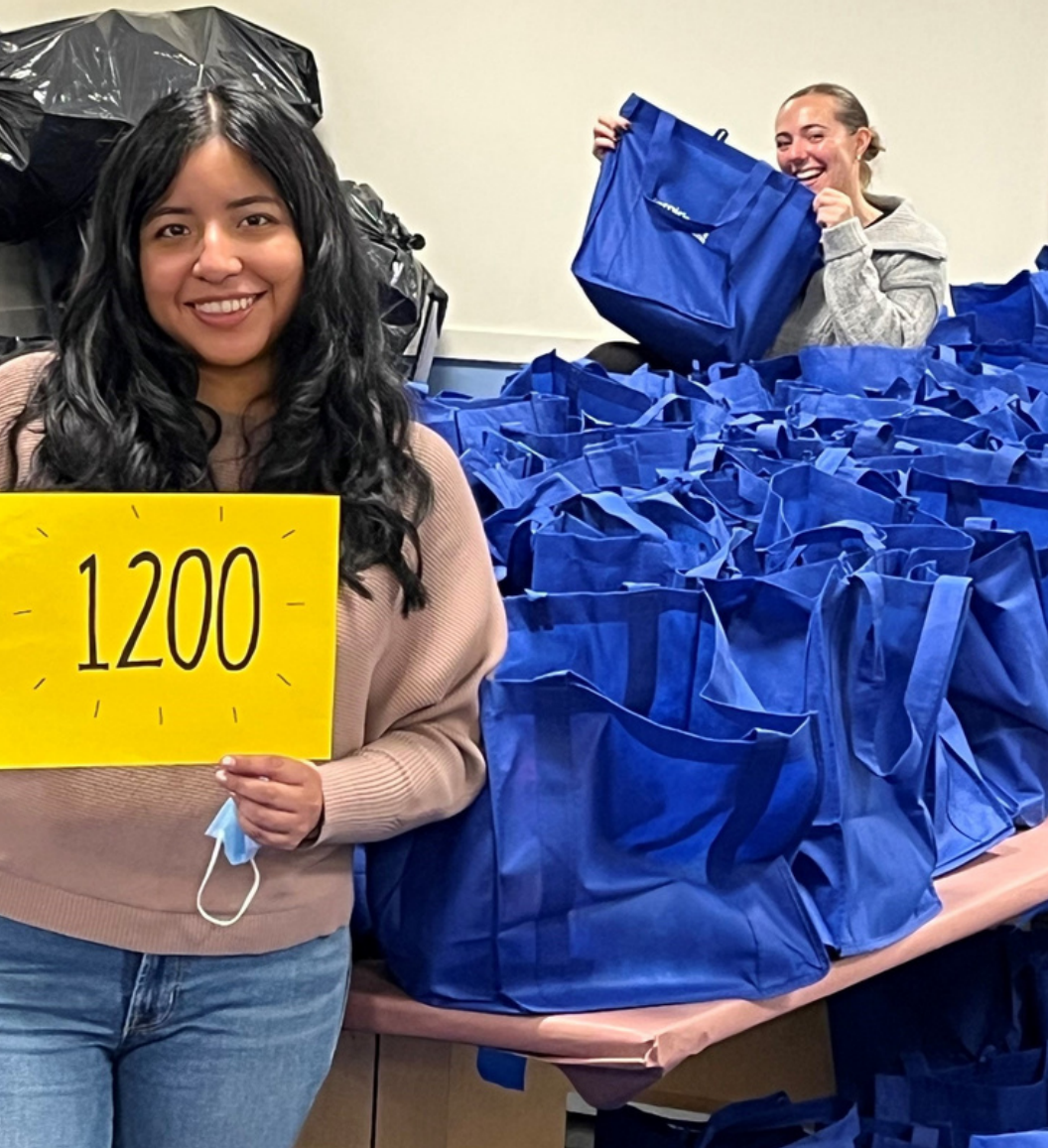
Inspirica's "Harvest for Hope" program provides over 1,200 Thanksgiving meal preparation bags to Inspirica clients and community members in need.