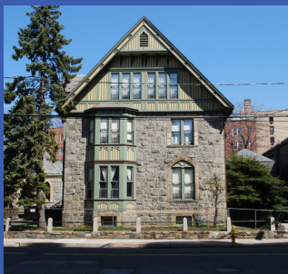
ROSE PARK APTS