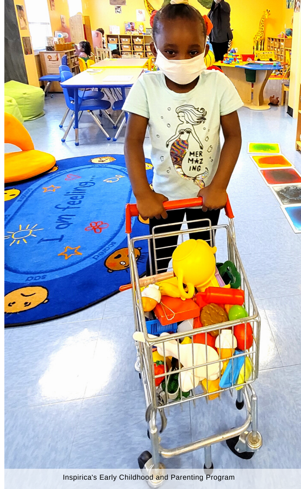
Inspirica's Early Childhood and Parenting Program

Results from January 1, 2021 - December 31, 2021