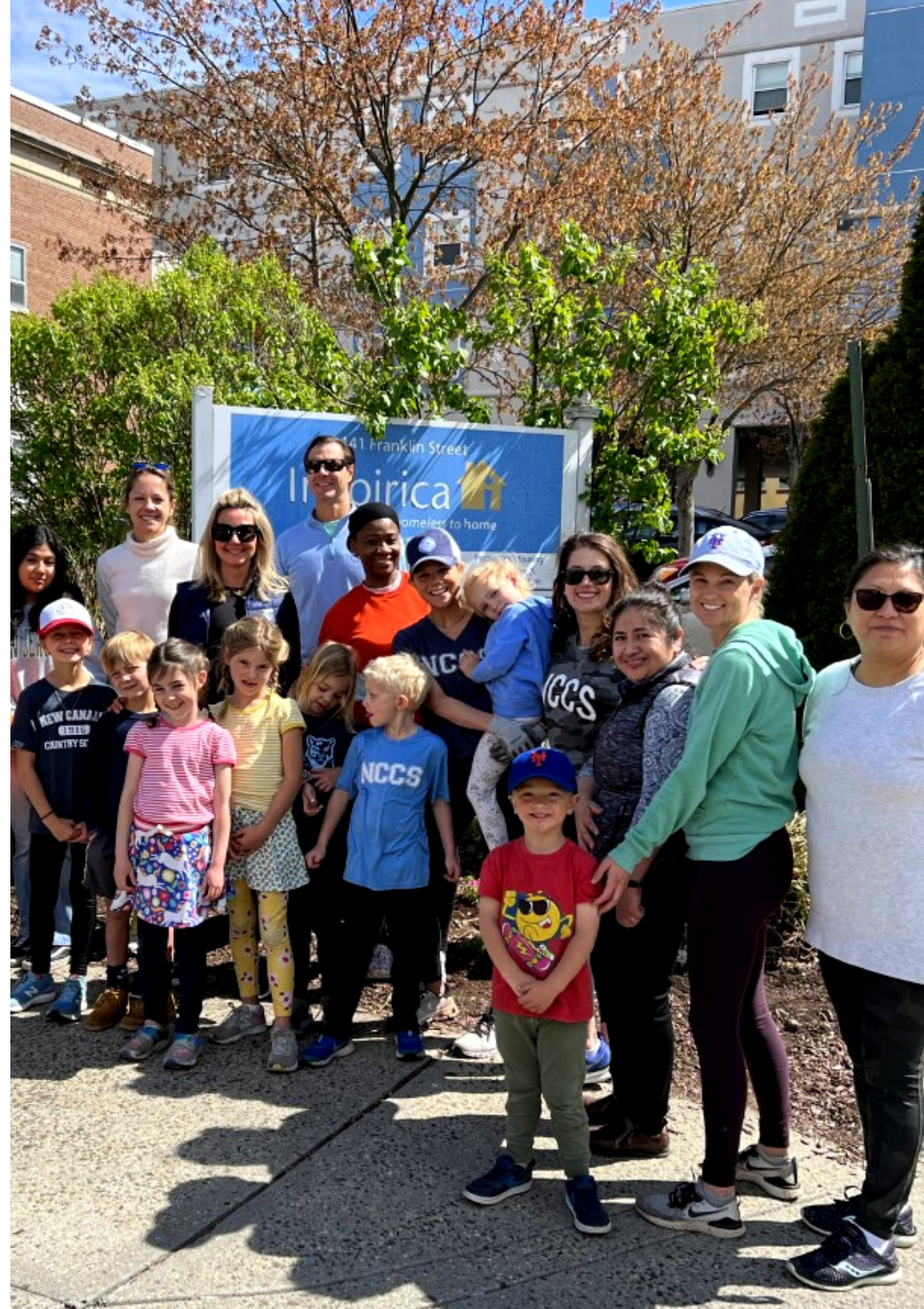
Volunteers from New Canaan Country School completing an outdoor beautification project at Inspirica's Franklin Campus as part of their Kyle A. Markes Day of Service.